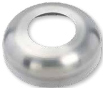
STYLE B SPUN ALUMINUM

Add $93 for a Split 2-Piece version of the Style A - FC11 Spun Aluminum Collar. Modify Part # COL1 to COL2 (Example Part #: COL2-A02S).