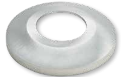
STYLE A - FC11 CAST ALUMINUM

BZT = BronzeTone Powder Coat BLK = Black Powder Coat WHT = White Powder Coat