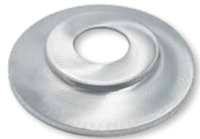
STYLE F - FC121 CAST ALUMINUM

Add $121 for a Hidden Bolt, Split 2-Piece version of the Style F - FC121 Cast Collar. Modify Part # COL1 to COL2 (Example Part #: COL2-F05C).