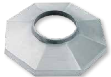
STYLE C - FC15 CAST ALUMINUM

Add $121 for a Hidden Bolt, Split 2-Piece version of the Style C - FC15 Cast Collar. Modify Part # COL1 to COL2 (Example Part #: COL2-C05C).