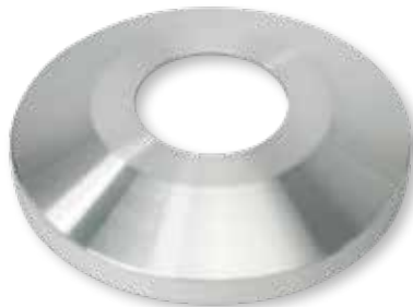
STYLE A - FC11 SPUN ALUMINUM

All Spun and Cast Collars are Available in Both 1-Piece and 2-Piece Designs